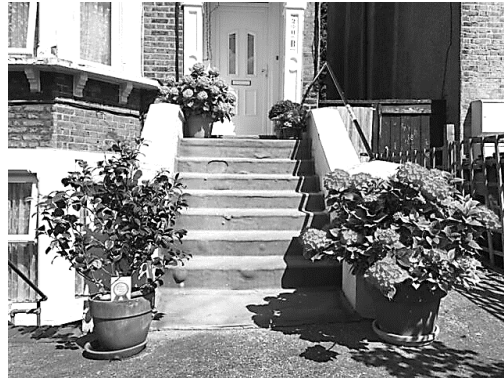
20B Elgin Road