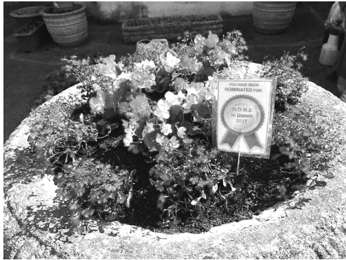
1 Mulberry Lane

We are looking for garden enthusiasts to get involved in this worthwhile activity for the 2018 competition with regards planning, nominating, judging etc. Please contact us via the H.O.M.E e-mail address or via our website.