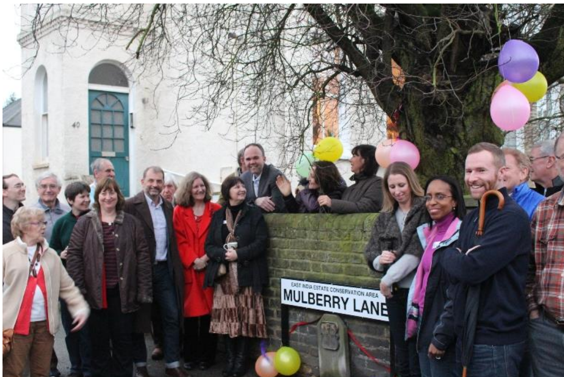
During the inauguration of the new road signs on 8 January 2016